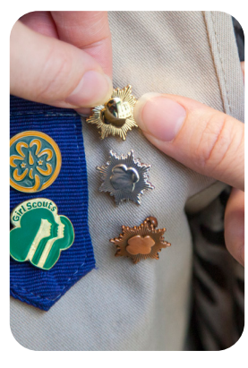
Prestigious Awards Leadership awards and scholarship opportunities