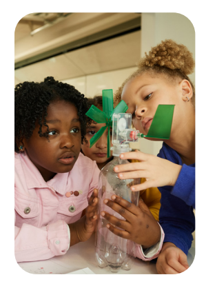
Fun Activities Research-backed programs to develop her skills