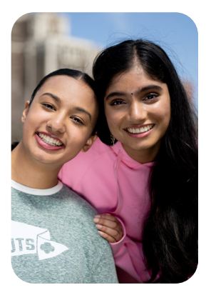
Lifelong Sisterhood Friendships and a strong community, locally and beyond