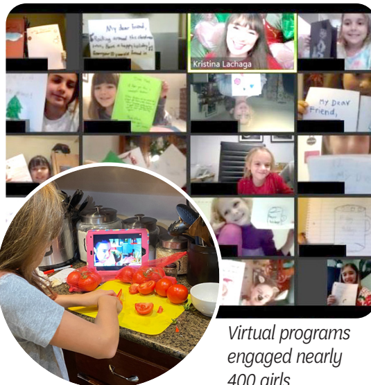
Virtual programs engaged nearly 400 girls