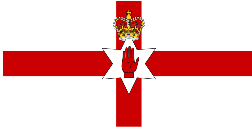
Northern Ireland Flag