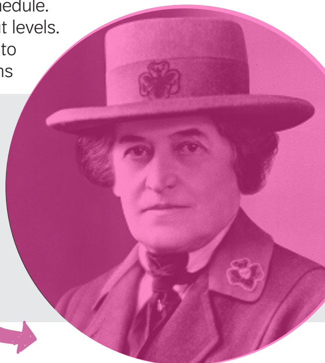
Our fearless founder!